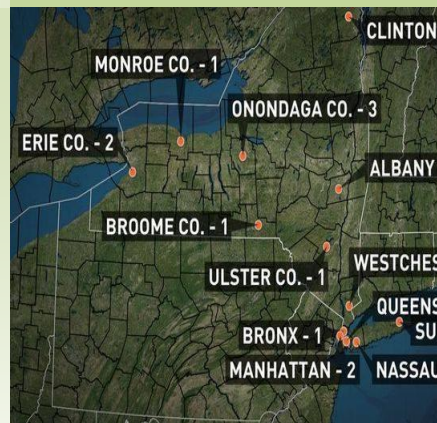
Pictured above: Map of New York State's 20 dispensary locations for the medical marijuana program set to kick off in 2016.